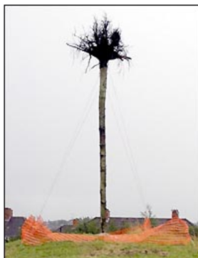
Barking ... tree on its head