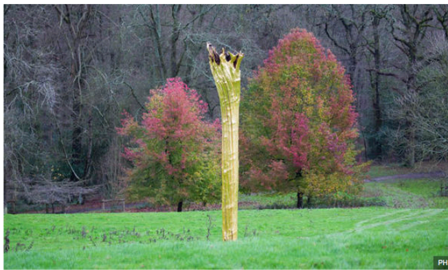
The golden tree sculpture by Elpida Hadzi-Vasileva will be unveiled on January 11

Elpida has transformed a 20ft (6metre) sweet chestnut tree, felled during the great storm of 1987 in Nymans' woodlands, into Rapture - a sculpture covered with 23.5 carats (4.7grams) of gold leaf.