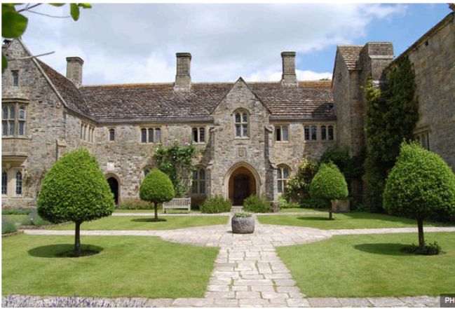
The unveiling will be the National Trust's Nymans

Rapture will be on show until February 28 and Nymans Lead Ranger, Chloe Bradbrooke, said: "I work with trees every day in their many varied forms and they are beautiful in their own right, but it's exciting to see one so transformed."