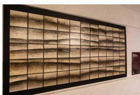
Reoccurring Undulation VI, 2017 by Elpida Hadzi-Vasileva. Part of Coastal Currents Arts Festival, Hastings UK, September 2017.

The material was selected through a process of engagement with the locality, its landscape and history. Membranes and skins are recurring obsessions in Elpida's work, taking dead waste materials and transforming them through repetition into new artefacts that demonstrate the latent beauty of this discarded matter. Elpida often endures weeks/months of repetitive and nauseating labour to create her work. It is precisely this repetition that creates an imaginative space, opens up possibilities and allows the work to evolve.