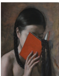
apunzel by Wen Wu