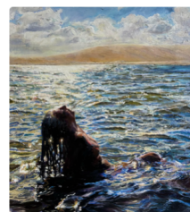
Lencois Dream by Lucille Dweck